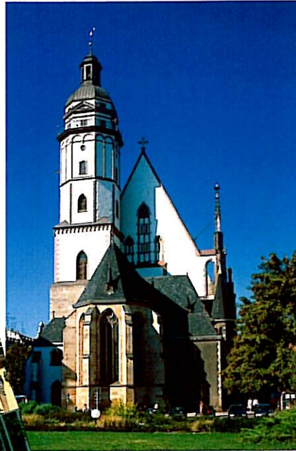
Leipzig – Thomaschurch

finest collections of Bach music and family manuscripts are located in Berlin.