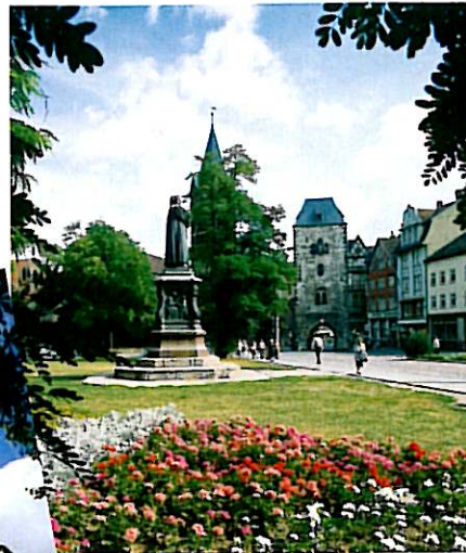
Eisenach – Luther Monument and Nikolaikirche